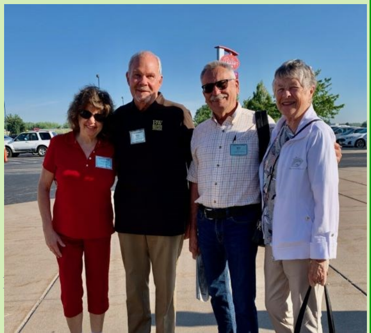
Mississippi River Cruise members and friends