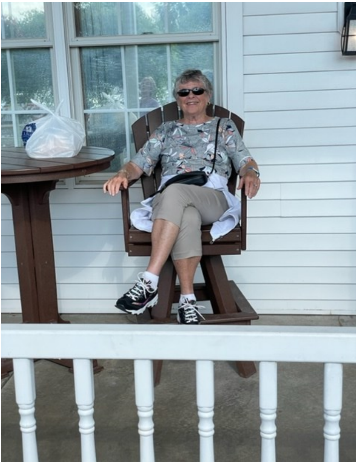
Mystery Traveler on the Mississippi