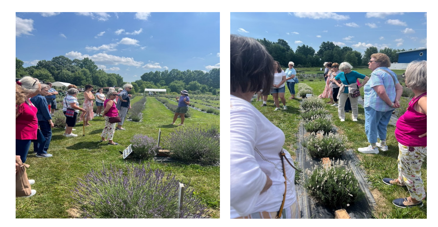
ILR Lavender and Blueberry Tour