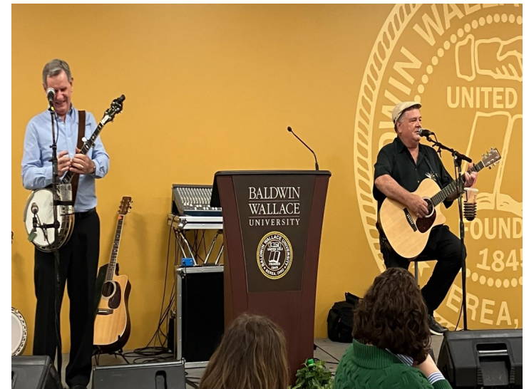
ILR members and friends enjoyed the luncheon followed by music from New Barleycorn at Strosacker Hall, Baldwin Wallace University Campus